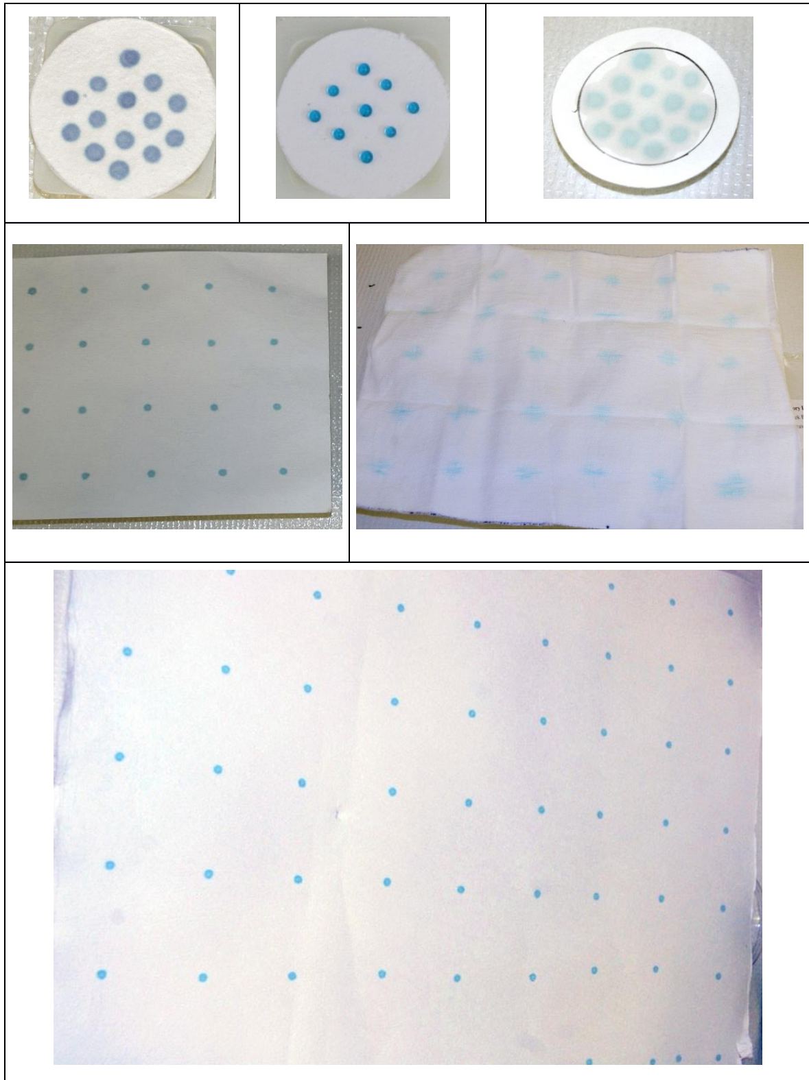
Fig. 2. Examples of spiked air filters.