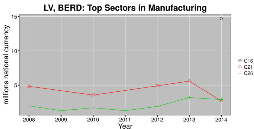
Figure 2. Latvia: Most R&D intensive manufacturing sectors

In the business services sector professional, scientific and technical activities, ICT, as well as the financial and insurance activities sector are the top BERD spenders. The Latvian ICT sector is less developed than in the neighbouring Baltic countries and for a while its R&D spending was quite small but since 2013 an increase is observable and the sector is developing fast, especially in the field of gaming services.