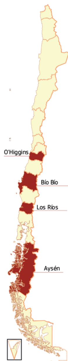
Figure 1. Focus on four Chilean regions

"Effectively decentralizing the country is another of our imperatives and that is why we have insisted on giving greater power to the territories [...]"