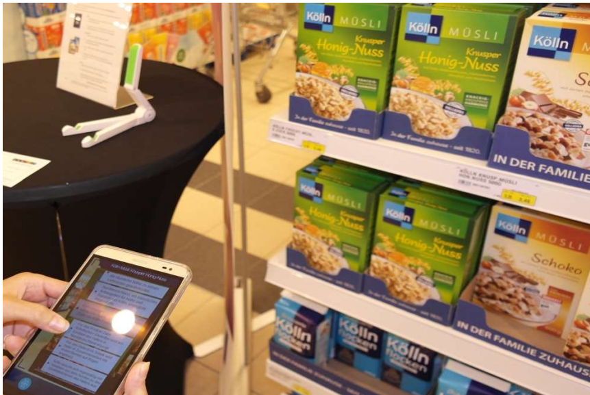
Figure 3. Example of an augmented reality tool providing food information in the marketplace (Joerß et al., 2021)

Four articles present studies on the effects of using augmented reality technology to deliver food information to consumers (Table 8). Most of these studies test features of information delivered through AR, rather than the effects of AR overall. They investigate how amount and level of detail of the provided information, level of consumers' interactivity with the information, or information content influence consumers' responses.