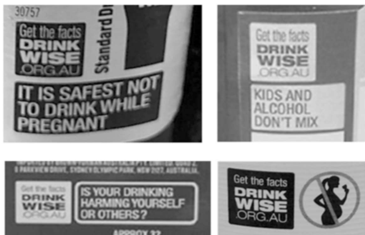
Figure 4. Example of labels placed in alcohol products in Australia displaying a link to the Drinkwise website (Coomber et al., 2015)

Vecchio and colleagues (2018) conducted a controlled experiment with 103 Italian wine consumers to compare labels providing different type of information (calories per glass, nutritional panel for 100ml, link to website, and key nutrients per glass) on wine bottles. The study showed that 74% of participants rarely or never looked for wine nutritional information. However, participants reported, in general, a high interest in additional information on wine nutritional values (mean=4.12/5) and in wine nutritional information on the label (mean=4.23/5). The main outcome measured in this study was preference, assessed through willingness-to-pay for the bottle of wine. Results show that preference was the lowest for the website link label, and higher for more descriptive labels (nutritional panel or key nutrients). These findings, while limited in terms of sample representativeness, suggest strong support of consumers for wine nutritional labels. Specifically, wine consumers least preferred format was the one providing less information, that is to say, no information available directly on the label besides the website link. Consumers prefer more informative formats such as nutritional panel or key nutrients' labels.