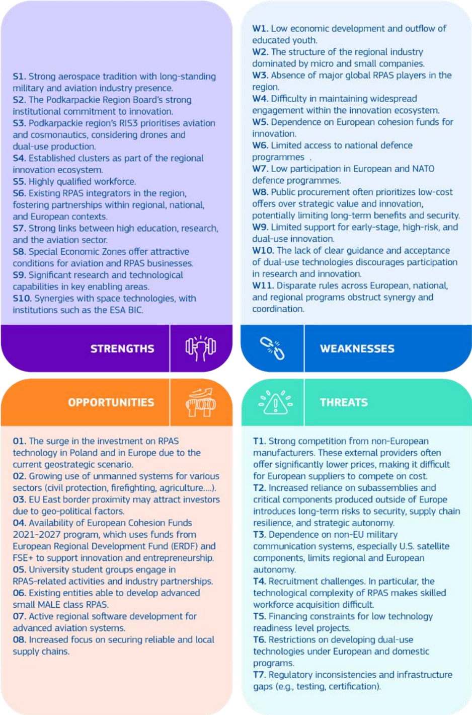
Figure 5 Podkarpackie Drone ecosystem SWOT

As a result of the workshops, stakeholders’ consultations and interviews the following SWOT was agreed