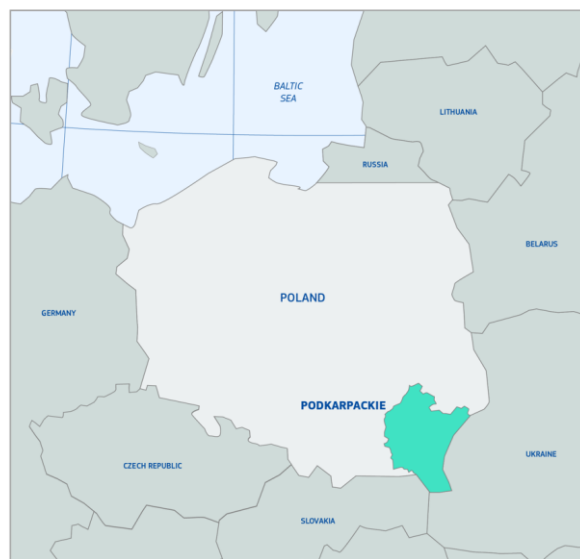
Figure 1. Podkarpackie region (Poland)

Situated on Poland's southeastern frontier with Ukraine, the Podkarpackie region covers 17,844 square kilometres and has a population of around 2.2 million. While its peripheral location has historically posed socio-economic challenges—qualifying it as a less developed region under EU cohesion policy—it has demonstrated consistent and dynamic growth over the past decade. The regional economy is based on industry (In 2022, 31.7% of GVA), positioning the region in 5 th place in Poland. The proximity to Ukraine also gives the region strategic importance considering recent military developments along the EU's eastern borders (see Figure 1).