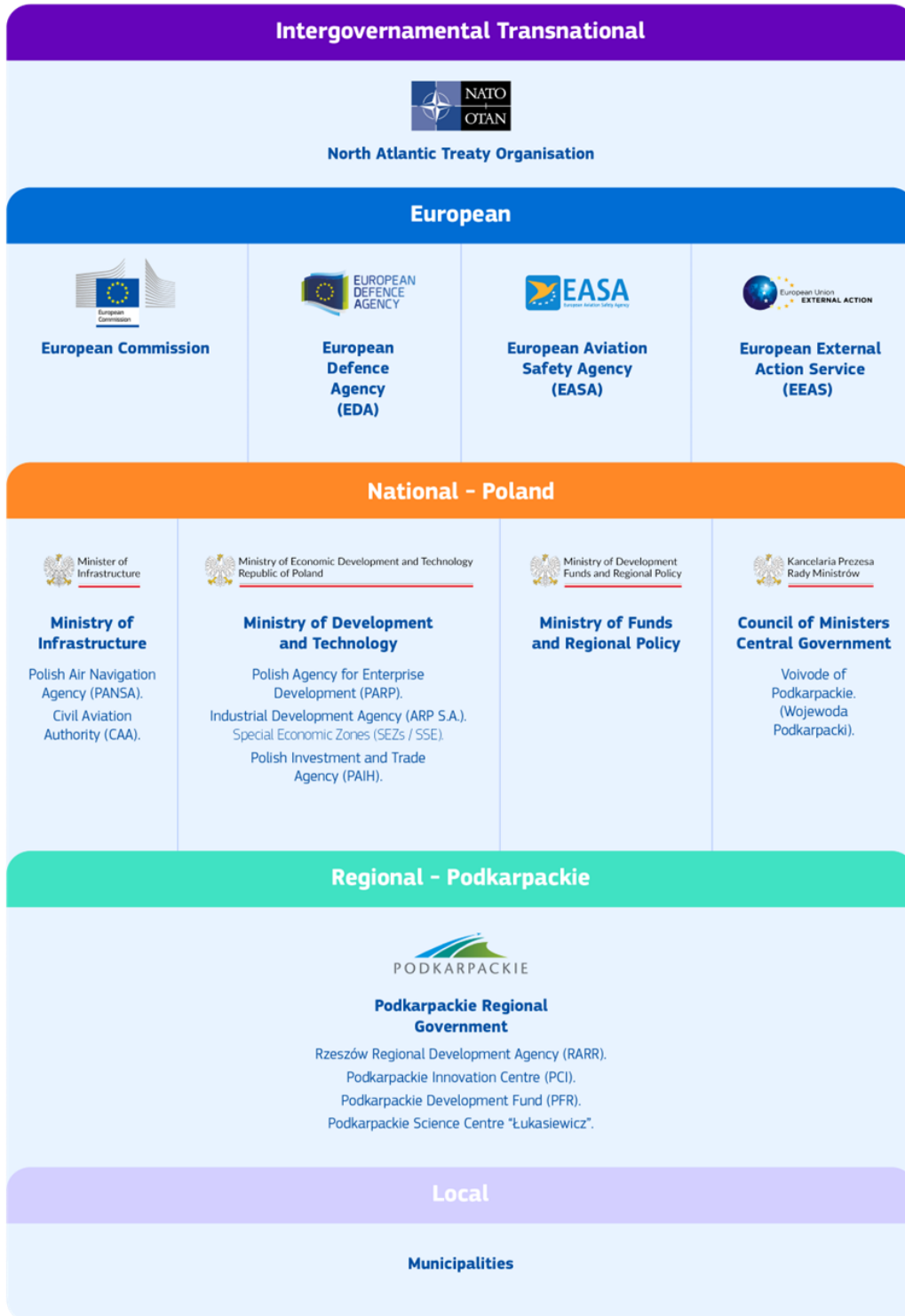
Figure 2 Podkarpackie's orientation and planning subsystem